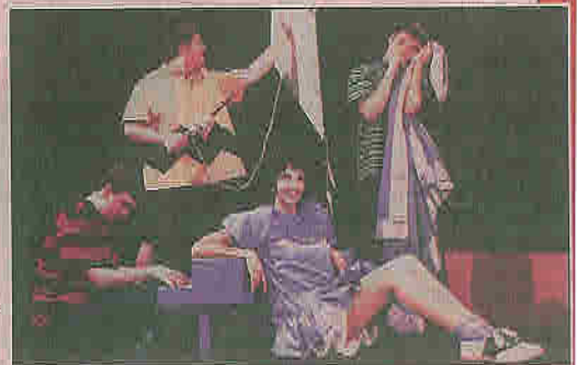
You're a Good Man, Charlie Brown will be offered to Oh Canada Eh? audiences after Christmas in early 2006.