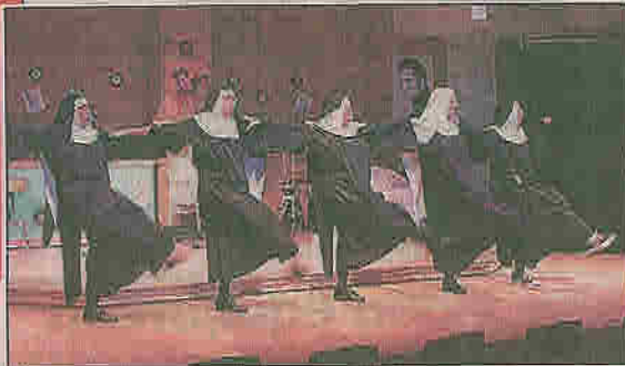
This Christmas party caper runs Nov. 24 to Dec. 17.

The Bow Valley's best known provider of dinner entertainment for tourists and conference visitors is venturing into new territory this fall and winter, and wants locals to come along for the sure-to-be hilarious ride.