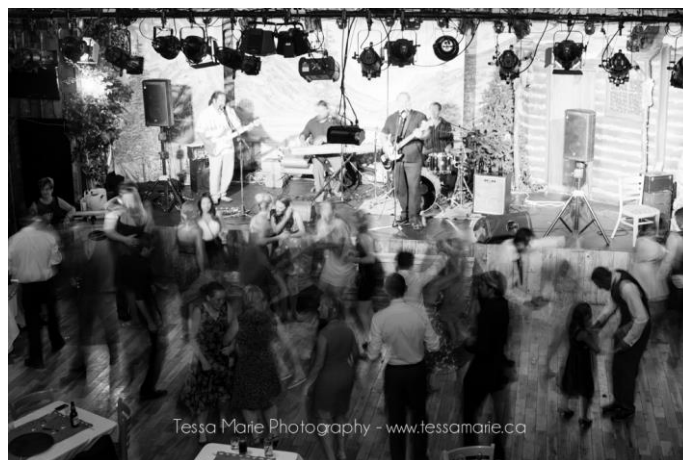
Tessa Marie Photography - www.tessamarie.ca

Whether your musical preference is a simple acoustic guitar accompanying you down the aisle, a harpist playing during your cocktail reception or a rock band we can deliver. Ask for details.